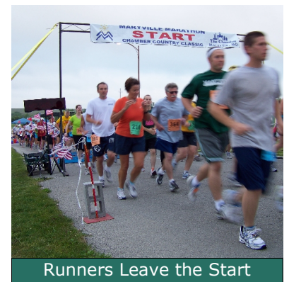
Runners Leave the Start

Here at the Chamber, we are grateful to the many individuals and organizations who volunteer to make this event happen. Now we know the runners appreciate you as well - 90% of those survey rated our volunteers as "outstanding" on a scale of 1 to 5.