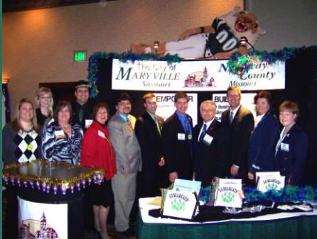
Maryville & Nodaway County Booth